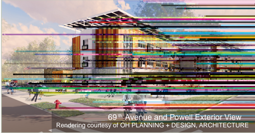
69 th Avenue and Powell Exterior View Rendering courtesy of OH PLANNING + DESIGN, ARCHITECTURE